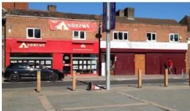
July 2016 photo

Late 18 th or early 19 th century parade of shops with accommodation above