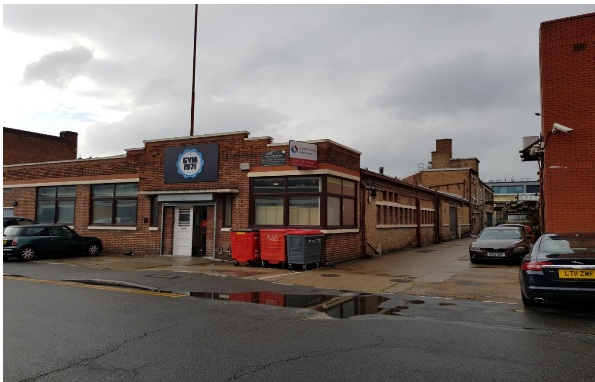
Globe House, 21 Lombard Road (Gym 1971)