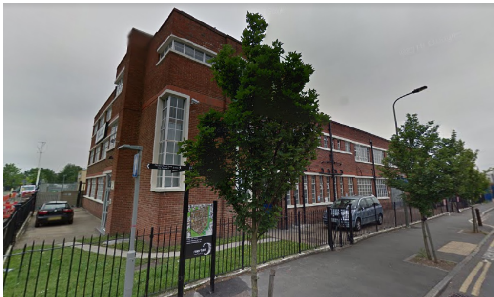
Endecotts, 9 Lombard Road