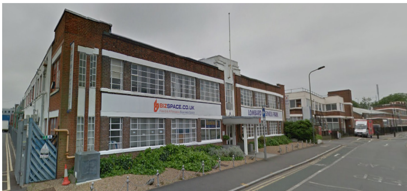
Lombard Business Park, 8 Lombard Road