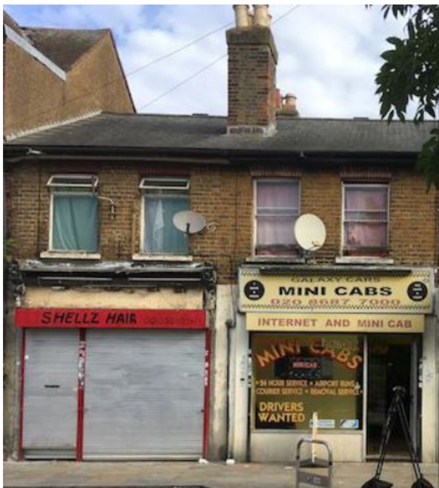
Victorian two storey parade of 4 shops with residential above.

Parade of four shops built prior to 1865. They are the oldest group of buildings on this side of the Fair Green. They were built as shops and remained in commercial use since then. They would have been built with traditional layout with shop at the front, parlour at the rear and the shopkeepers' accommodation above. It is a two storey parade with two storey rear wings sharing party walls. Double pitched slate roofs.