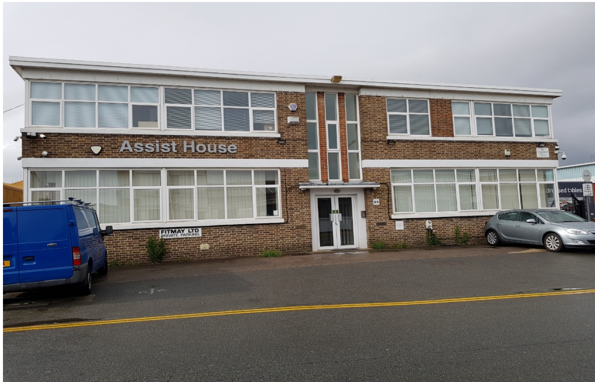
Assist House, 25 Lombard Road. (Fitmay House)

The Lombard Trading Estate was previously known as Morden Factory Estate. It was mainly developed by Commercial Structures Limited. The G H Zeal factory building was built for G H Zeal in 1933. It is now known as The Lombard Business Park. Zeals, manufactures of thermometers, moved to a new factory in 1960s on Deer Park Road. Morden Factory Estate was famous its toy factories that made Triang Toys and Pedigree dolls but sadly these factories have been replaced.