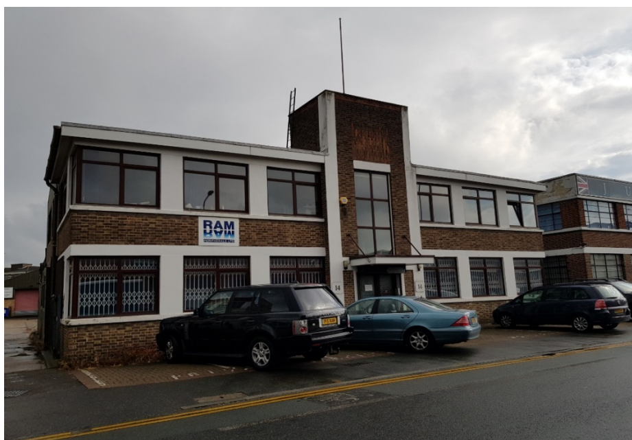
14 Lombard Road. (RAM)