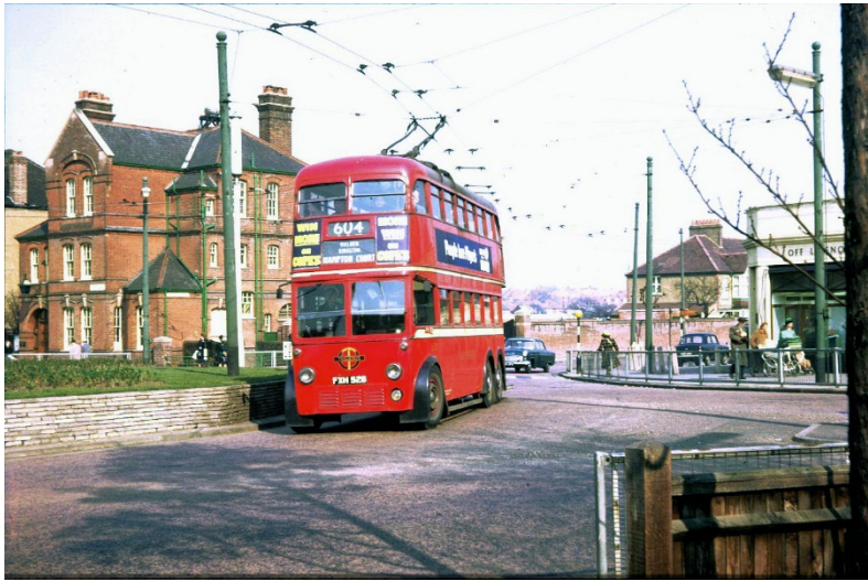
The Fountain, 15:28 Trolleybus on route from Burlington Road.