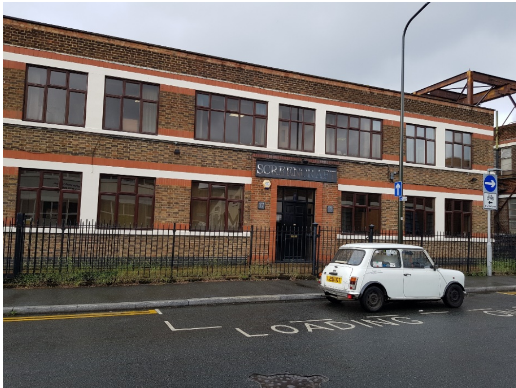
17 Lombard Road (Screen Craft)