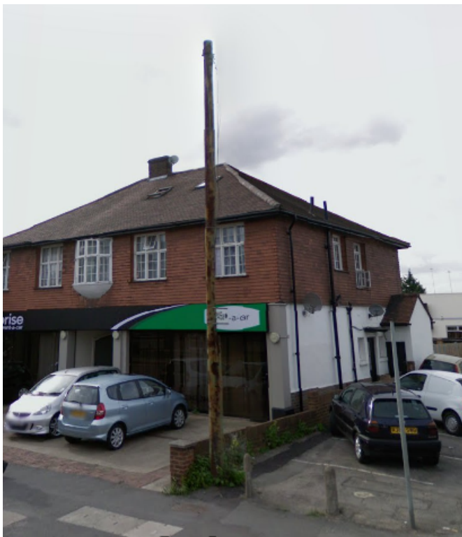
241-243 Burlington Road